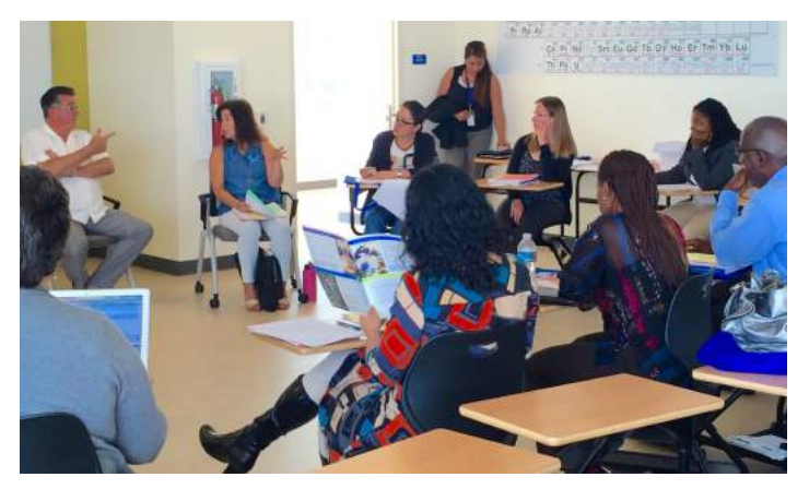
Above: New employee orientation during Flex Day.

Chancellor for Workforce Development and Continuing Education (WDCE).