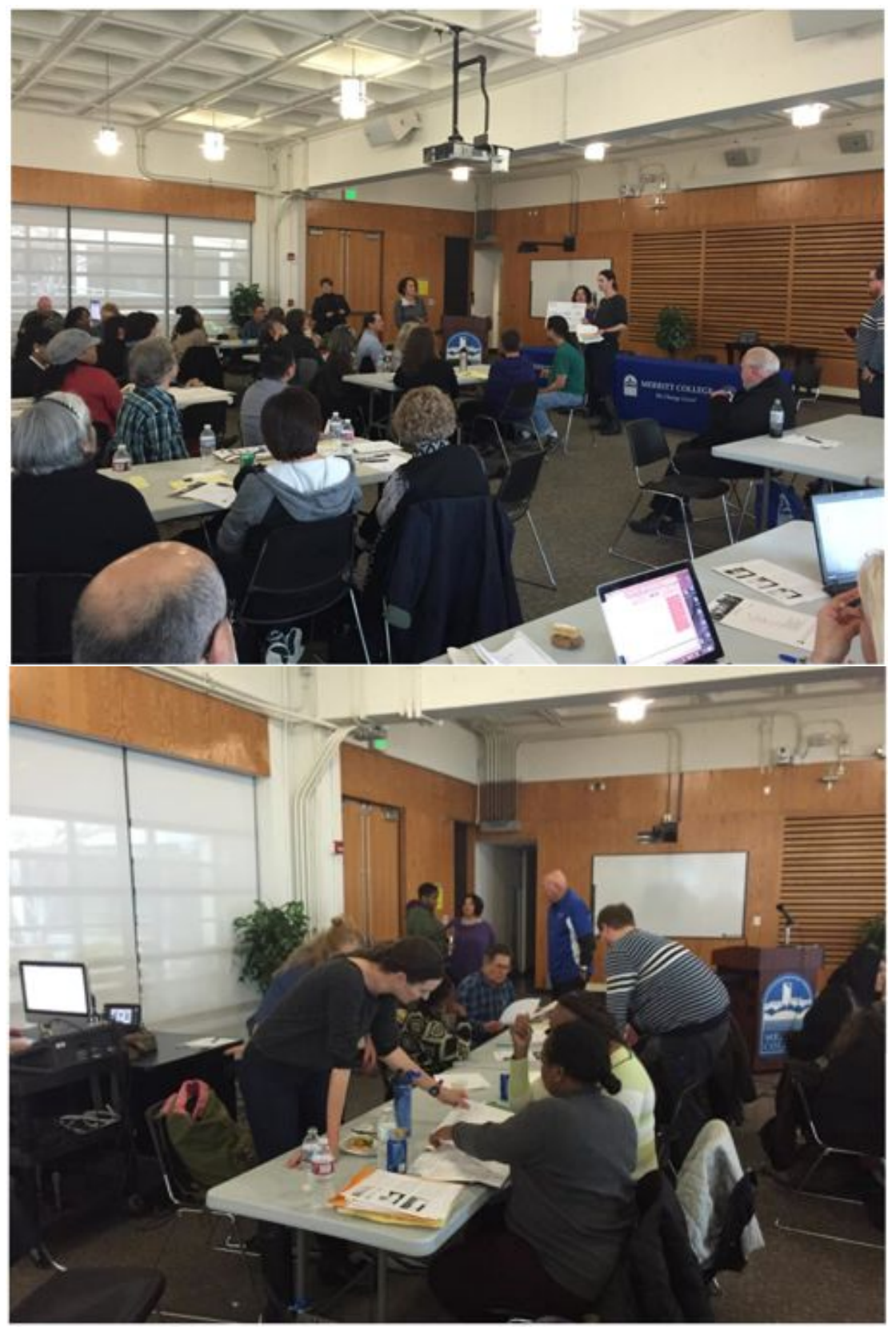
Program Learning Outcome Workshop Jan. 22, 2016