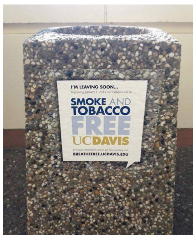
University of California, Davis