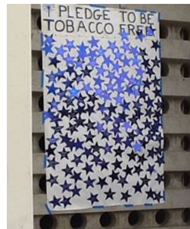
University of California, Riverside