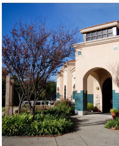
Solano Community College

Image top left: San Diego State University; top right: Santa Rosa Junior College