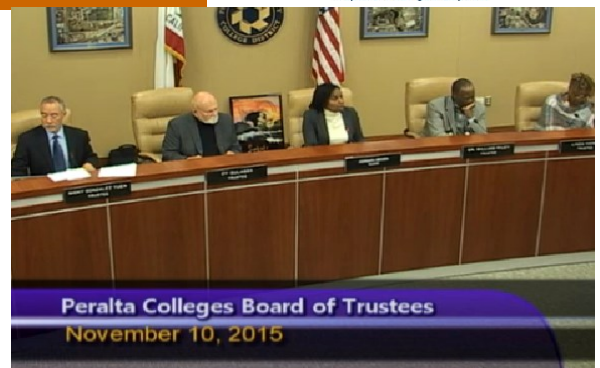
Peralta Colleges Board of Trustees November 10, 2015