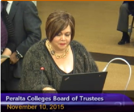
Peralta Colleges Board of Trustees November 10, 2015